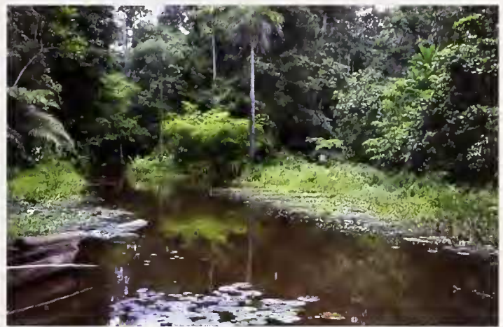
Fig. 5. Flooded forest of Forêt de Lokoli.

Finally, some reptiles were collected also in Cotonou and Bohicon, on house walls and in gardens, and markets were visited to inspect the reptile species offered. Most of the reptiles were collected by UK by visual encounter and focal sampling. Moreover, specimens were brought by the locals, particularly by two snake hunters from Didja and Za-Kpota respectively who even received an alcohol-filled bucket in order to keep interesting snake finds for some days. The Swiss zoologists of the Biolama project provided us with few, but very important voucher specimens (e.g. Hemidactylus sp.n., Holaspis guentheri ) taken in trunk electortraps used for the entomological survey.